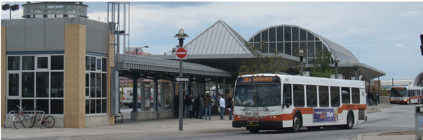
Figure 8-5: Various transportation forms exist within the city. The transit network is extensive and serves the large resident population and employment base, as well as those passing through the city.

8.2.3.4 The City will initiate express transit on Intensification Corridors and will continue to employ express services as part of the implementation for the Mississauga Bus Rapid Transit.