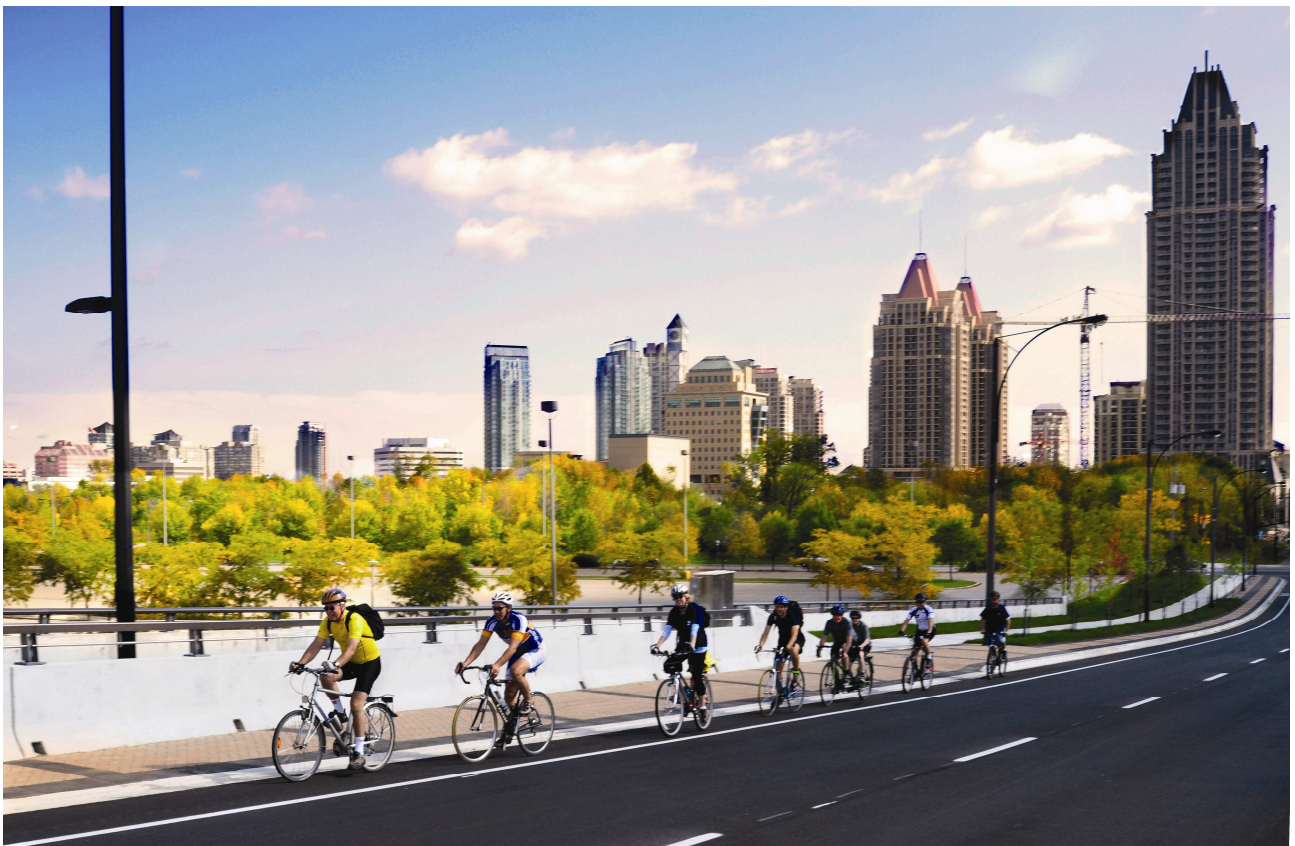
Figure 8-1: Mississauga promotes a range of transportation modes. In addition to providing for the car, facilities for transit, cycling, and walking are a priority. Promoting a range of transportation choices will be particularly important in areas where intensification is encouraged, such as in the Downtown.

Mississauga is evolving from a city that has a suburban, vehicle-oriented built form to a more urban municipality. The transformation of the transportation system to meet the needs of the future is not without significant challenge. Mississauga's transportation infrastructure, which is largely built and relatively new, was designed around a grid of widely spaced major roads designed to move large volumes of vehicles efficiently. Within the grid are a series of collector roads and local