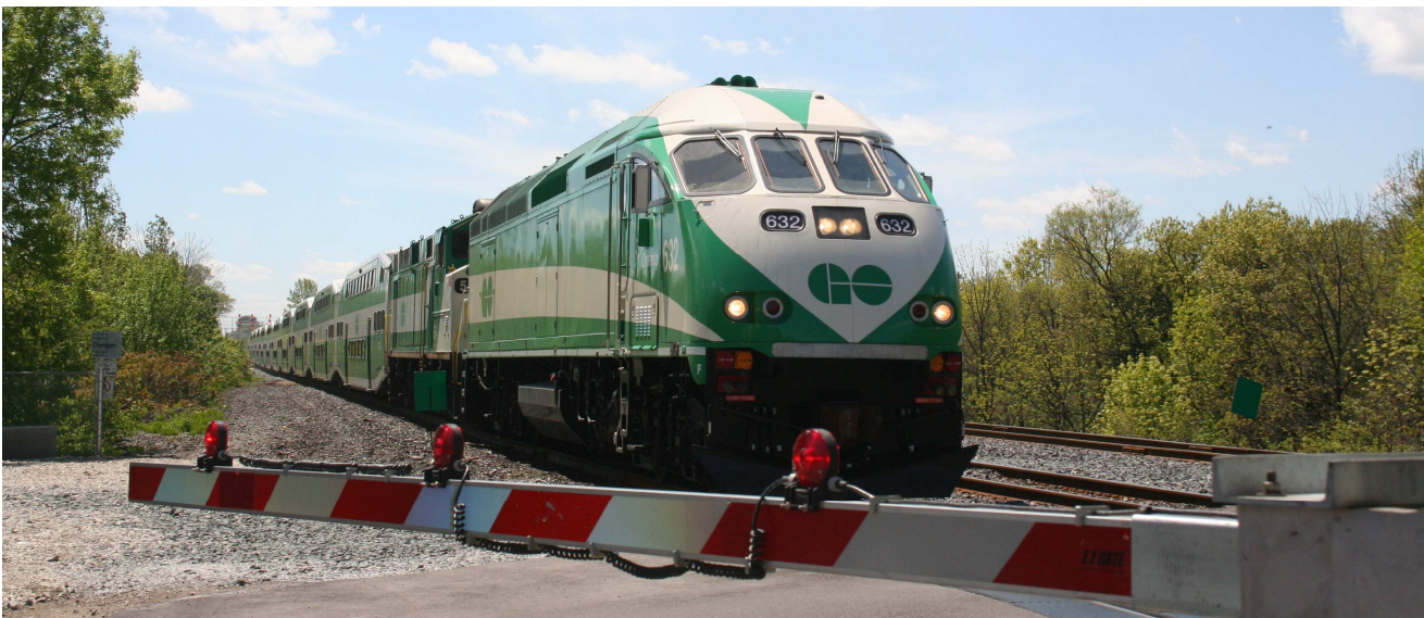
Figure 8-11: The rail corridors in Mississauga are shared by both freight and passenger trains, such as the GO train depicted above. The City recognizes these corridors as assets in the transportation system.

8.8.1 In planning for new or existing transportation