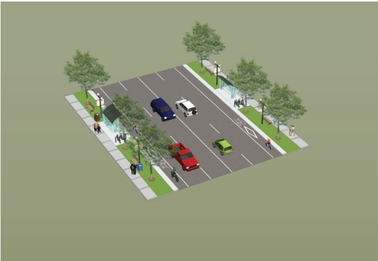
Figure 8-3: The ability to create multi-modal roadways will be influenced by right-of-way widths. Wider rights-of-way will allow for dedicated space for different transportation modes, however, where rights-of-way are narrower transportation modes will need to share space.