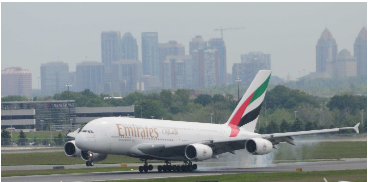
Figure 8-12: The Airport supports the local and regional economy and is a significant component in the city's transportation network.

8.9.2 Mississauga will support goods movement access to the Airport to promote the Airport as a key goods movement hub.