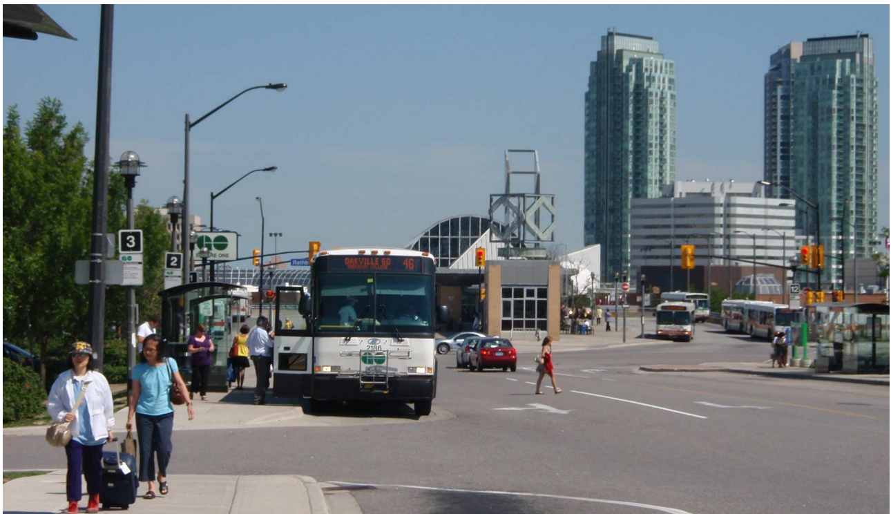
Figure 8-9: The Downtown Core Mobility Hub is an example of where people can live, work, shop and recreate in a mixed use environment supported by transit.

Mobility hubs include both gateway and anchor hubs as shown on Schedule 6: Long Term Transit Network.