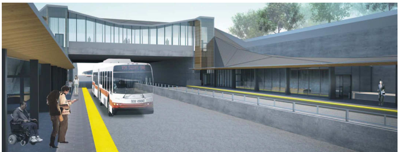
Figure 8-4: Higher order transit such as the Highway 403/Eglinton Bus Rapid Transit will provide competitive alternatives to the automobile.

8.2.3.3 Mississauga Transit will connect to commuter rail services operated by GO Transit that provide access to downtown Toronto and other destinations within the region.