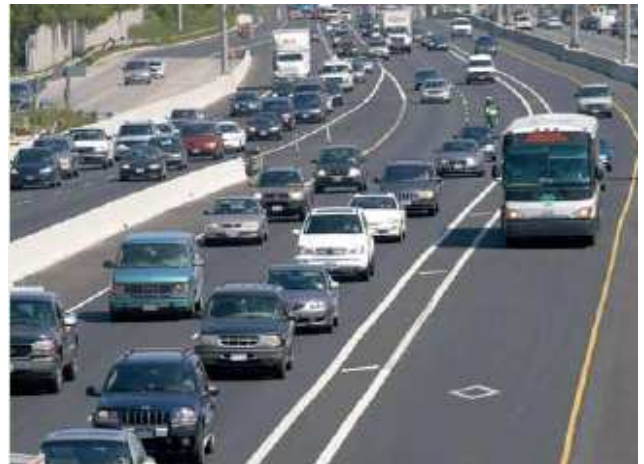
Figure 8-8: High Occupancy Vehicle (HOV) lanes such as those on Highway 403, encourage people to carpool or take transit.

8.5.1 Mississauga will encourage TDM strategies that promote transit use and active transportation , and reduce vehicle dependency, single-occupant vehicle travel, trip distance and time and peak period congestion.