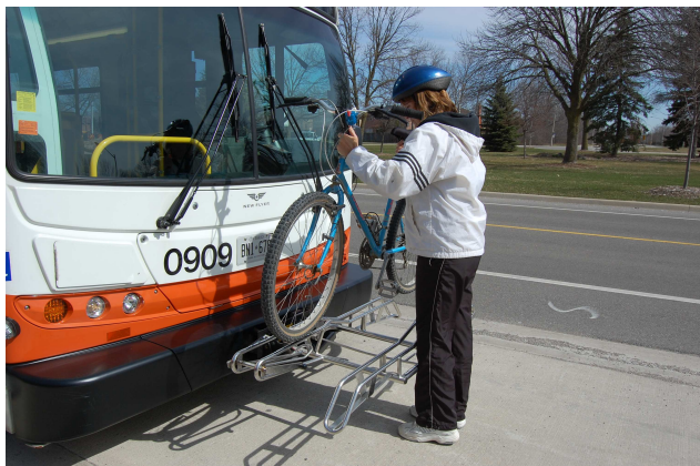
Figure 8-6: People often use multiple modes of transportation in their daily commute. Supplying bike racks on buses is one example of how Mississauga supports cycling.

8.2.4.3 The City will construct cycling facilities to, from and within Intensification Areas as a priority.