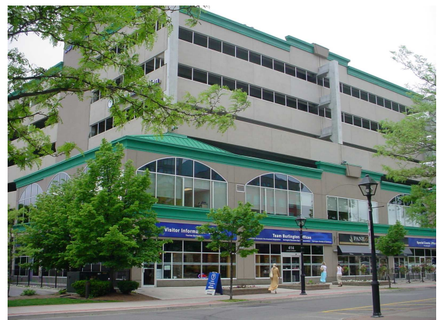
Figure 8-7: Parking garages are a better use of space than surface parking and provide an opportunity to incorporate a mix of uses, as this parking garage in Burlington illustrates.