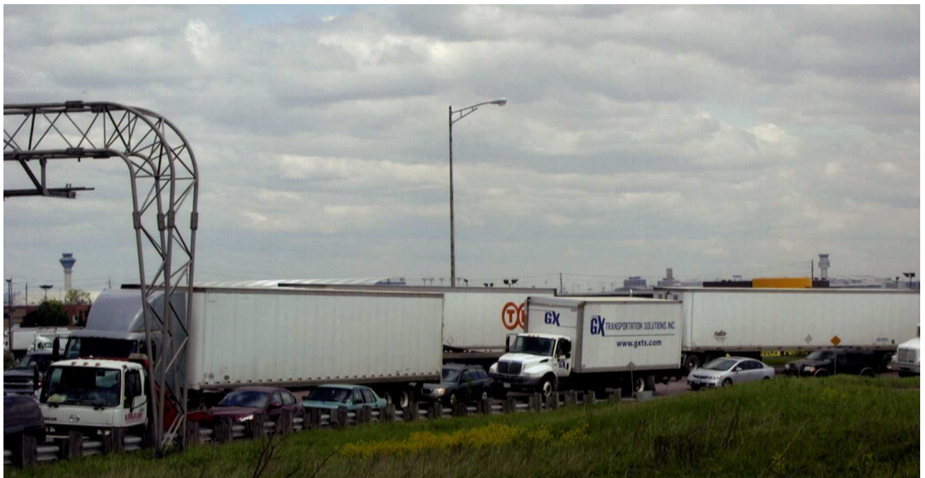
Figure 8-10: Several 400 series highways and major roads traverse Mississauga and support the many businesses reliant on efficient goods movement.

8.7.4 A denser grid of roads will be established where required in Employment Areas to support the efficient movement of goods.